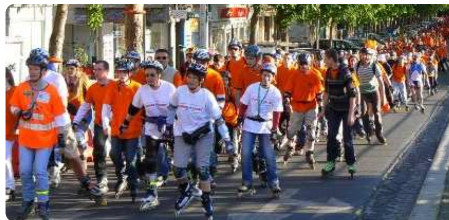
The Pizza Sprint Roller course is on our website