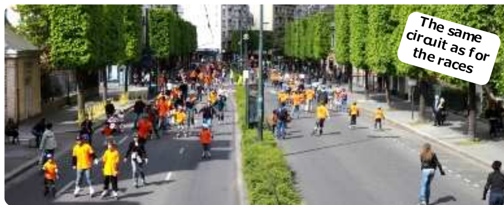
The same circuit as for the races

* Provided free by Pizza Sprint while stocks last.